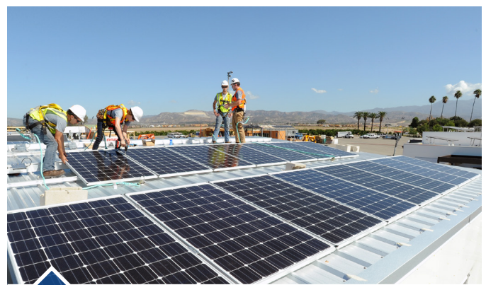
Solar panels being installed in California.